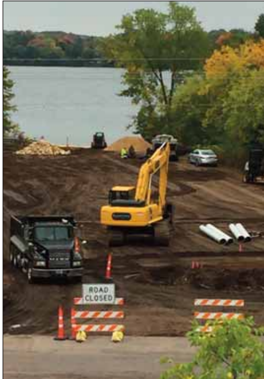
Above and at left construction is currently underway to make much needed improvements to the Lake Sylvia public access.