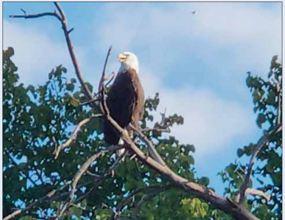
Above, a bald Eagle perches on a tree limb overhanging Lake Sylvia.