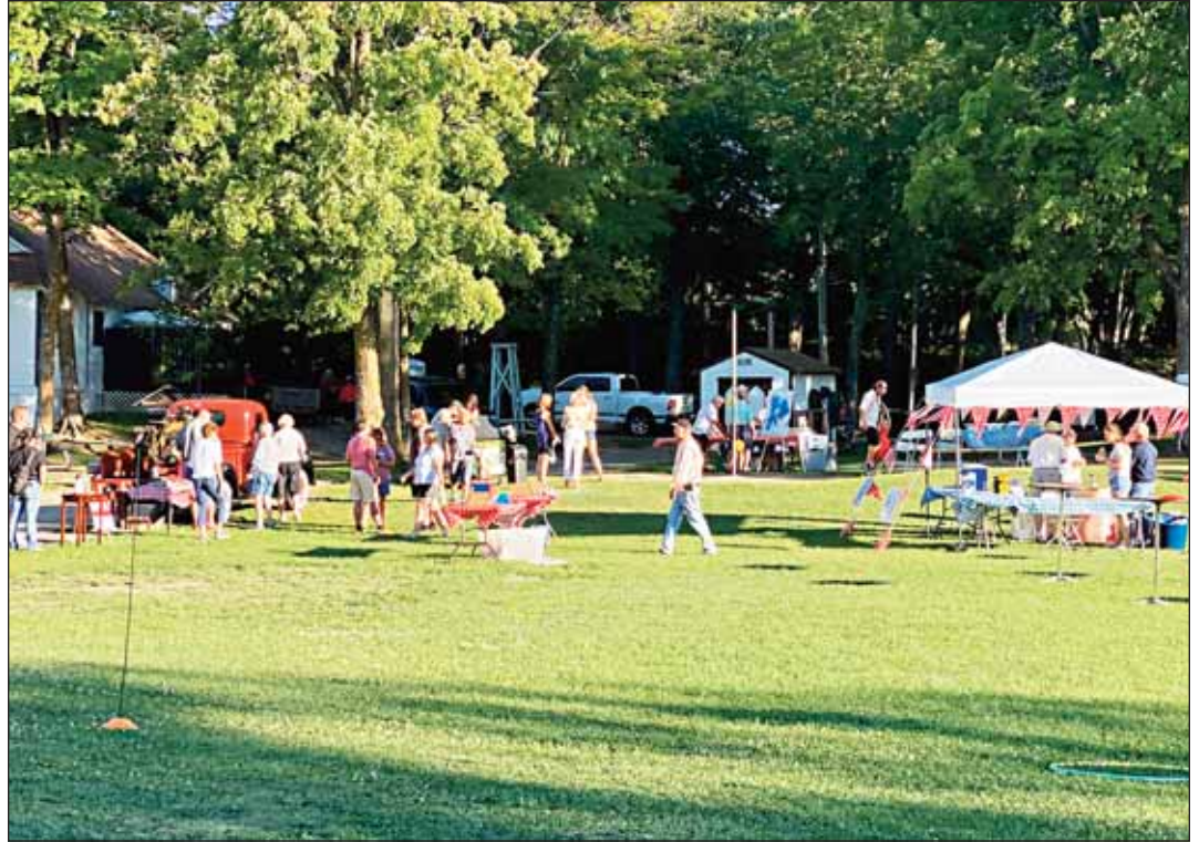
Above and below, picnic goers are engaged in the various activities available at this year's picnic. In addition to the on-site playground, kids and adults alike enjoyed a bouncy house, games such as fricket, bocci ball, limbo, frisbee challenges, gunny sack racing, corn hole, face painting, music and much more.

Anchor Dock & Lift, Country Chevrolet, Oak Realty, Star Bank, Annandale Dental Clinic, Hoffman Construction, Sylvia Area Storage Units, Backyard Reflections, David Burd State Farm Insurance.