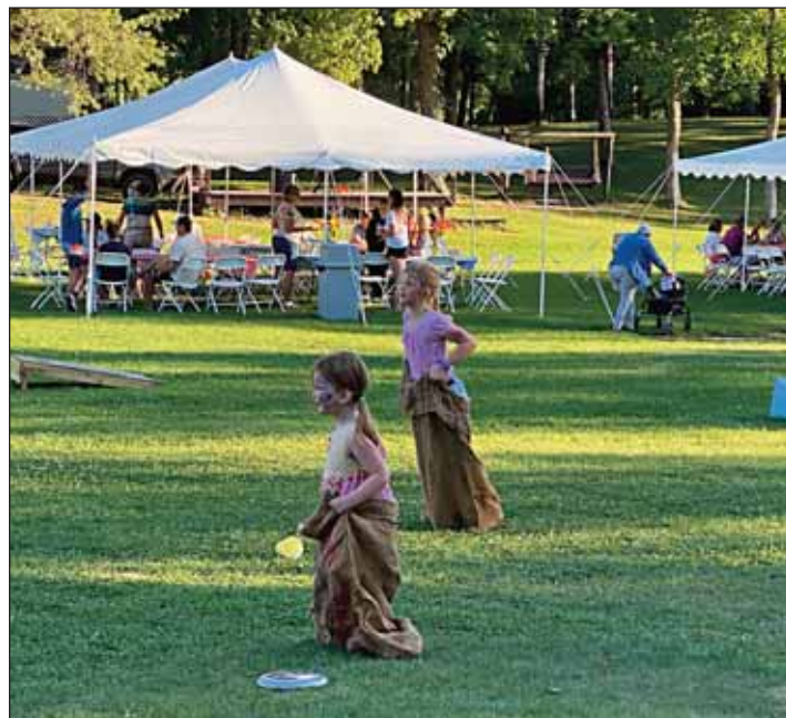
A couple of girls enjoyed playing with the gunny sacks at the picnic.