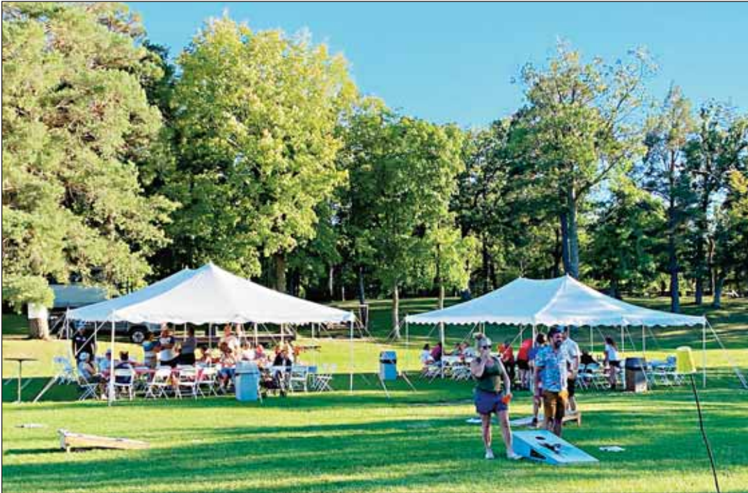
There was great weather for the annual GLSA picnic held at Chi Rho Center. About 200 people attended the picnic this year. Above, a couple can be seen playing corn toss while others mingled in the tents.